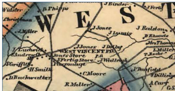
An atlas shows the Post Office location.