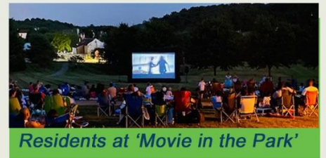
Residents at 'Movie in the Park'

The movie will be shown near the gazebo in Andrew Evans Park. However – in the event of rain – the movie will be moved to inside the large meeting room of the Township Building. So bring some blankets, chairs and snacks, and join us for this enchanting movie!